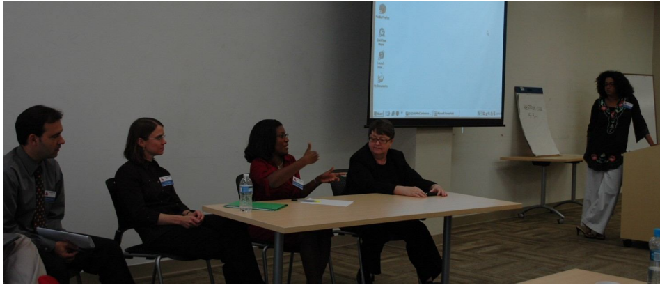
Living with HIV Panel